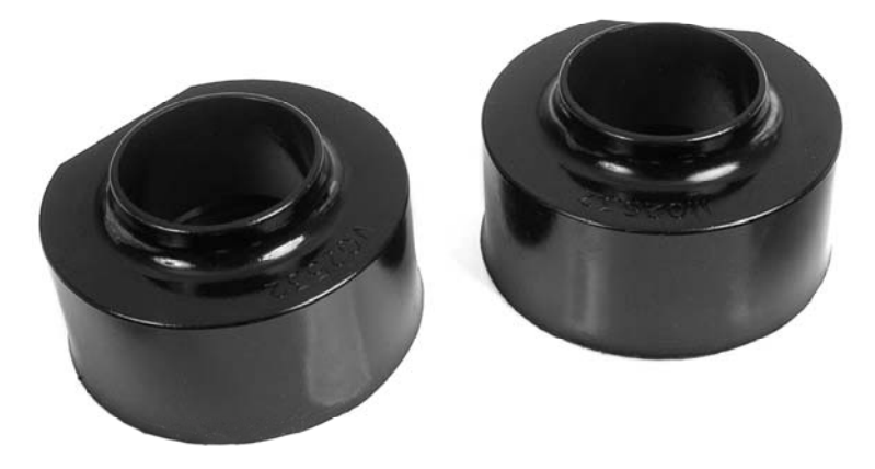
Front 1 1/2" Spacers Available....Part # 7594