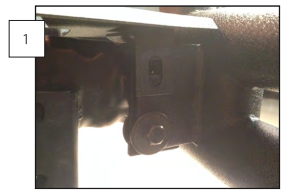
Remove the top bolt of your tube bumper.

It is recommended that you have an additional person available to help during this installation, parts can be awkward to hold and support by yourself.