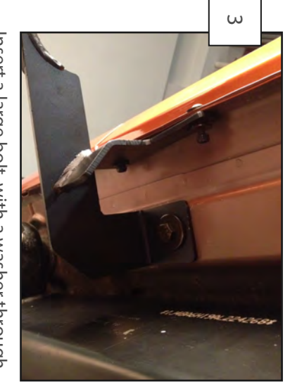
Insert a large bolt, with a washer through the bracket and into the body hole that contains the nut plate. Hand tighten the hardware.