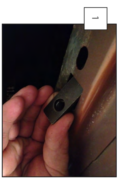
Insert a nut plate for each bracket into the existing holes on the bottom of the body.

It is recommended that you have an additional person available to help during this installation, parts can be awkward to hold and support by yourself.