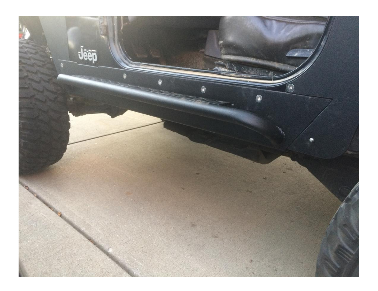
Installation Instructions Written by ExtremeTerrain Customer Jake Wall 9/20/2015