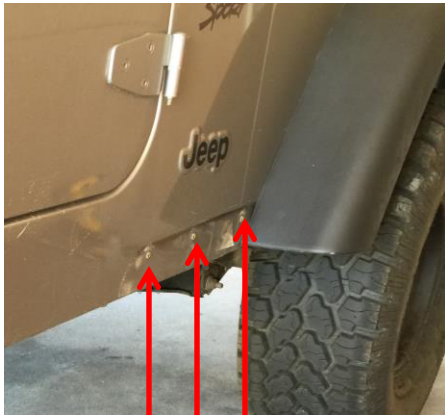
(1) (2) (3) (Figure 4)