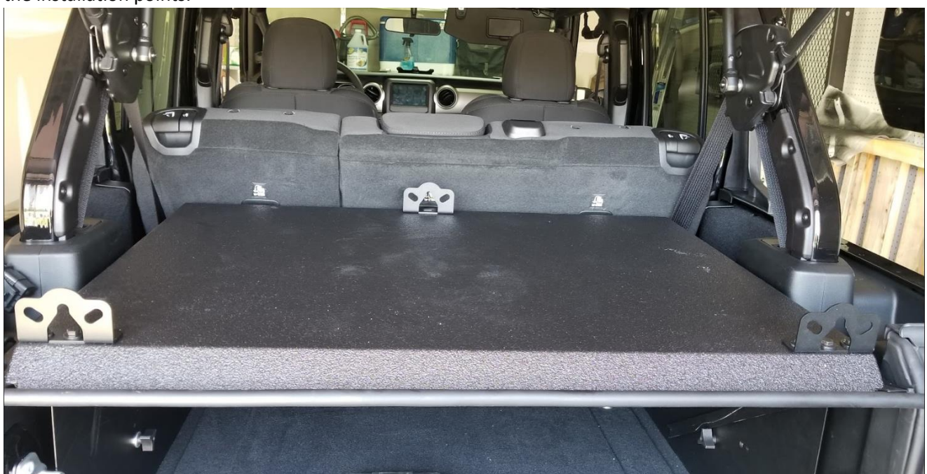
Installation Instructions Written by ExtremeTerrain Customer Zack M. 25JUL18.

6. Repeat for all other modular gear anchors in the chosen configuration. The final product should look like this, depending on the chosen configuration and placement. Be sure to vacuum all metal shards on top of and under the installation points.