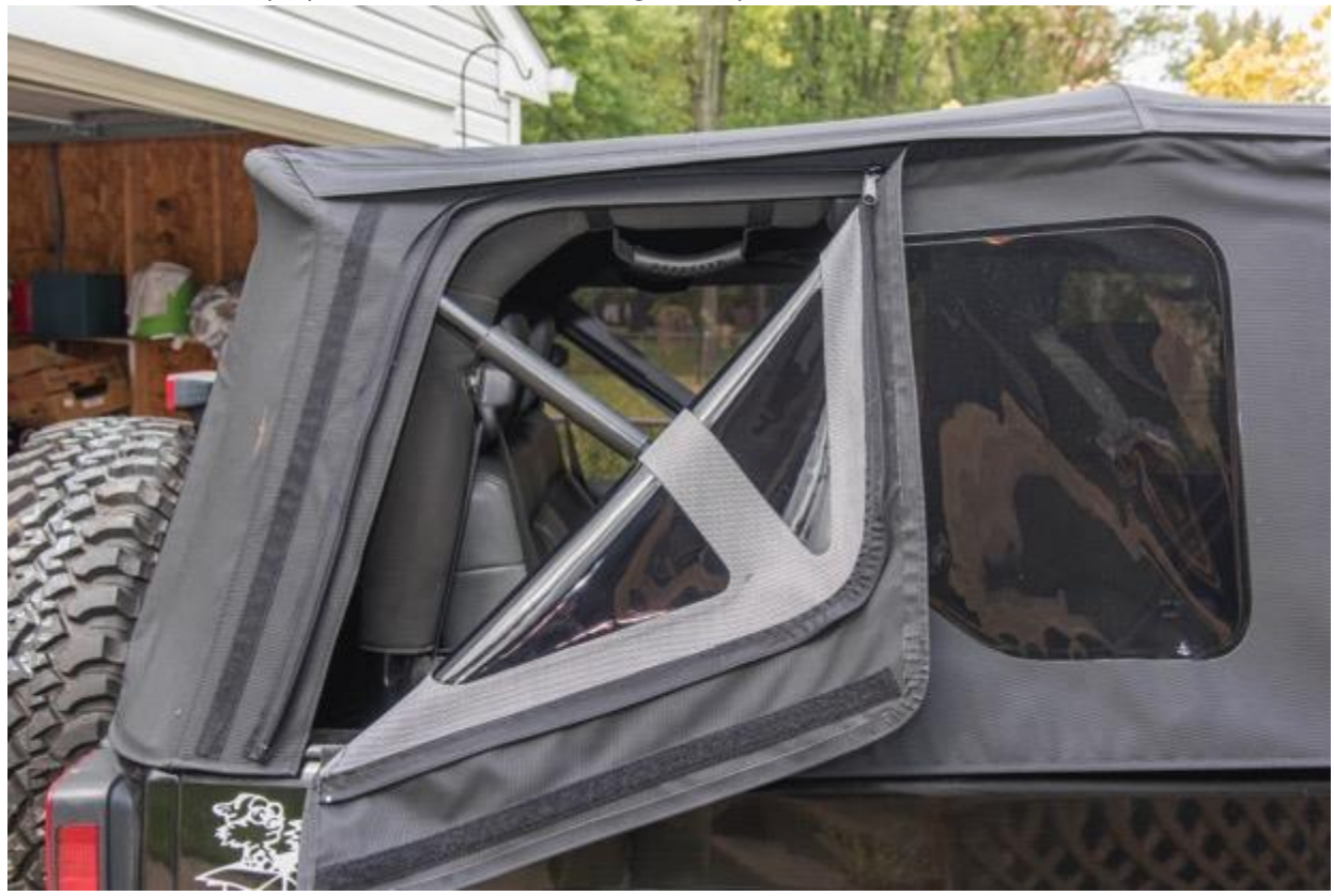
19. You have now completed installing your new top!

18. Zip up side windows left and right and place belt rails to side channels.