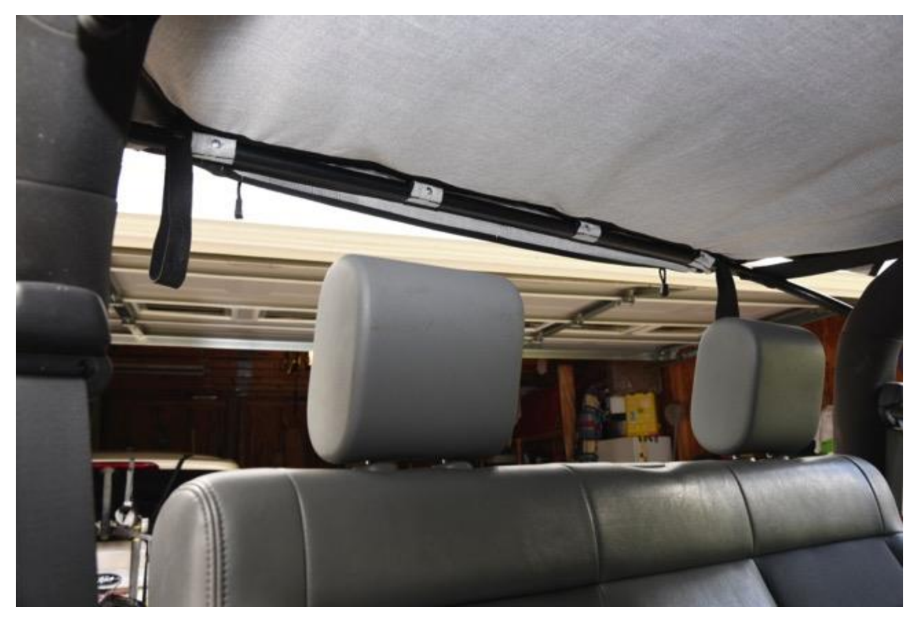
17. Zip in back window and replace your tailgate window bar to window.

16. Go inside Jeep and look for four tabs in top by back bow and screw tabs to back bow with the four screws you saved from earlier.