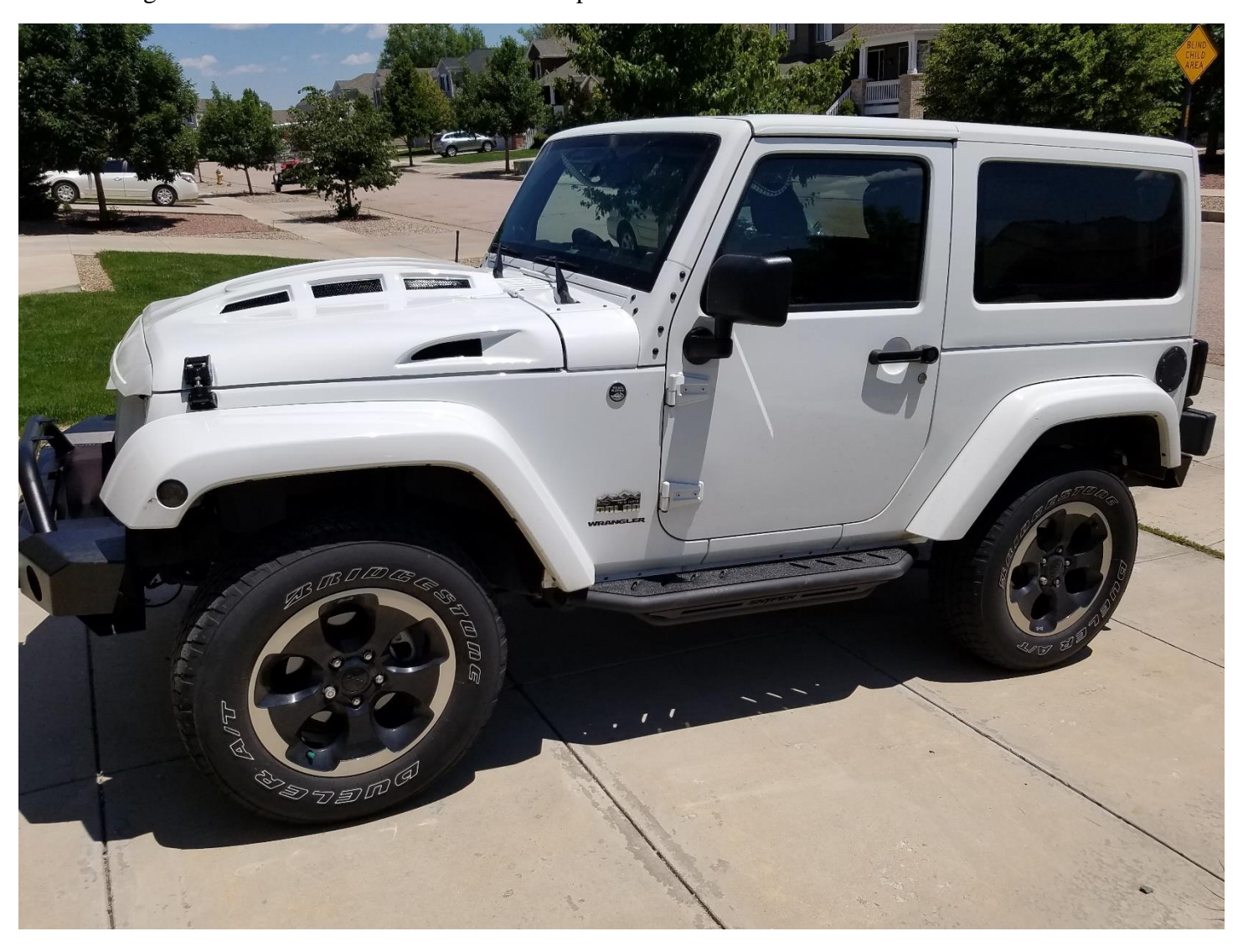
Installation Instructions Written by ExtremeTerrain Customer: Tyler A on 7/14/17

5. Congratulations! You are done. It is that simple.