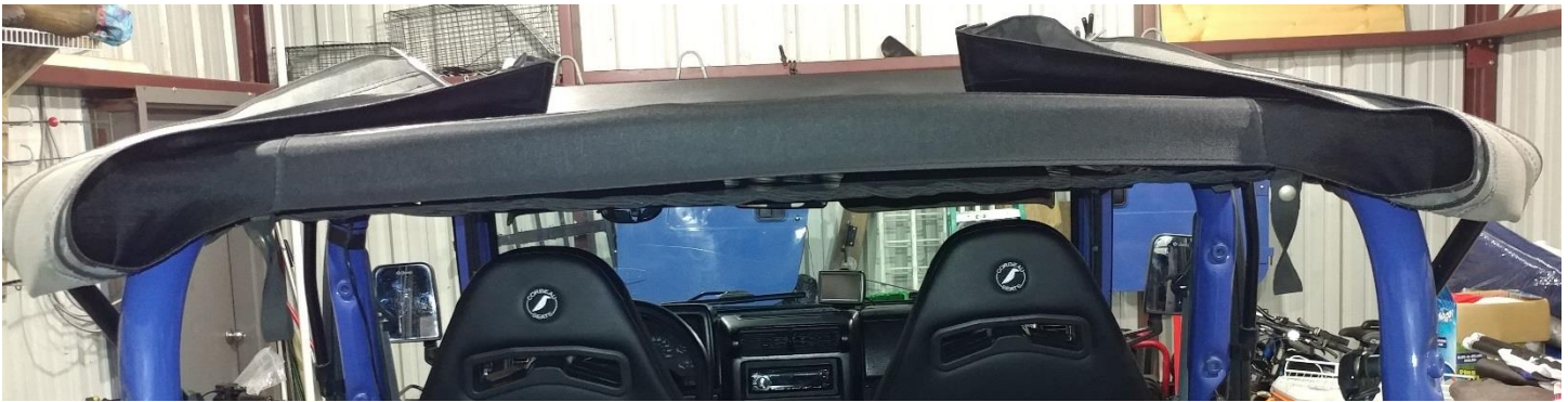
4. Collapse the top into the rear of the Jeep.