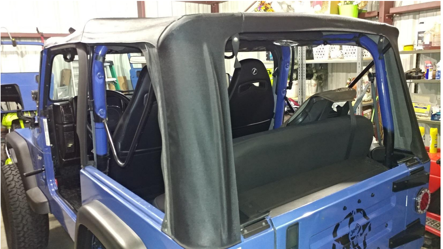
3. Fold the sail flaps over the top