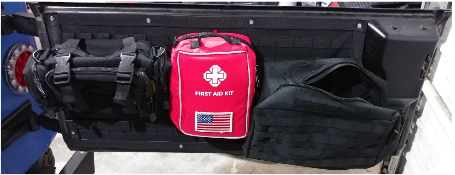
Installation Instructions Written by ExtremeTerrain Customer T. Boyer 3/12/2018