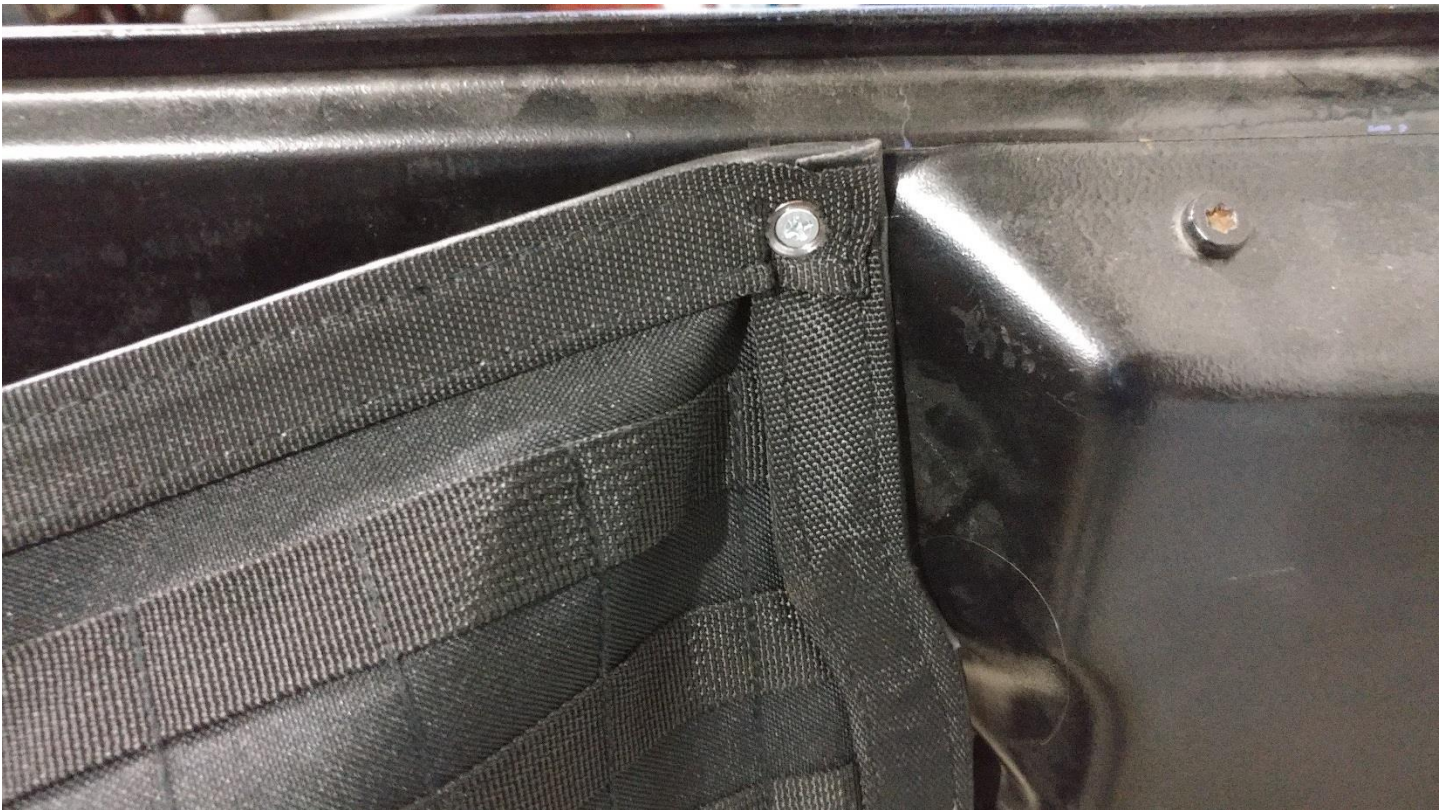
4. Stretching the top section while using the top line of the tailgate I located the top left screw