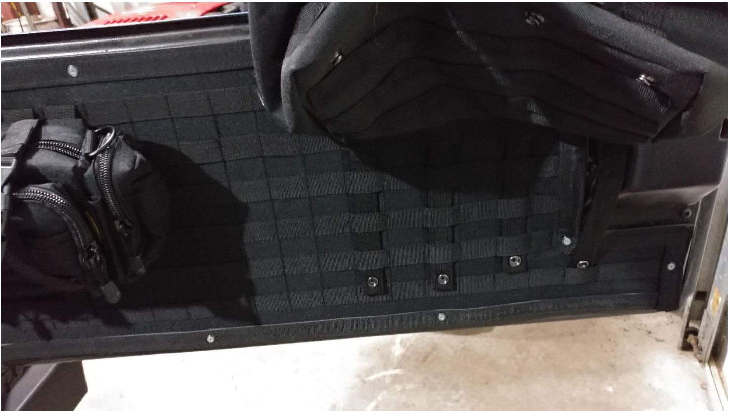
9. Installation complete