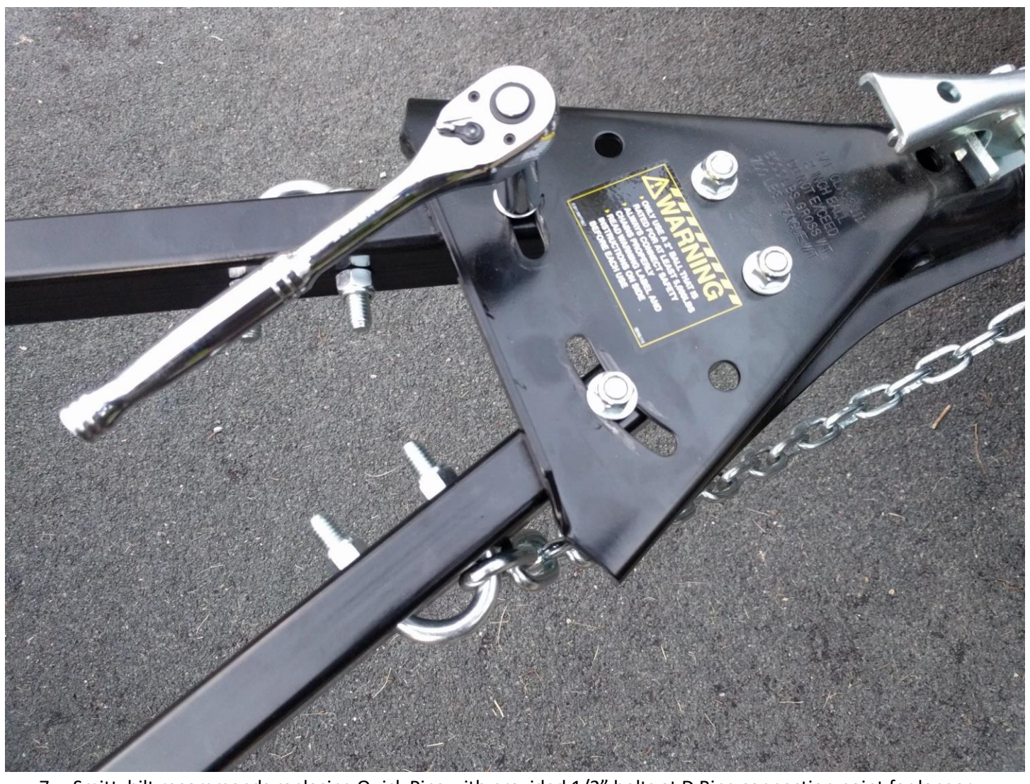
7. Smittybilt recommends replacing Quick Pins with provided 1/2" bolts at D Ring connection point for longer distance towing.