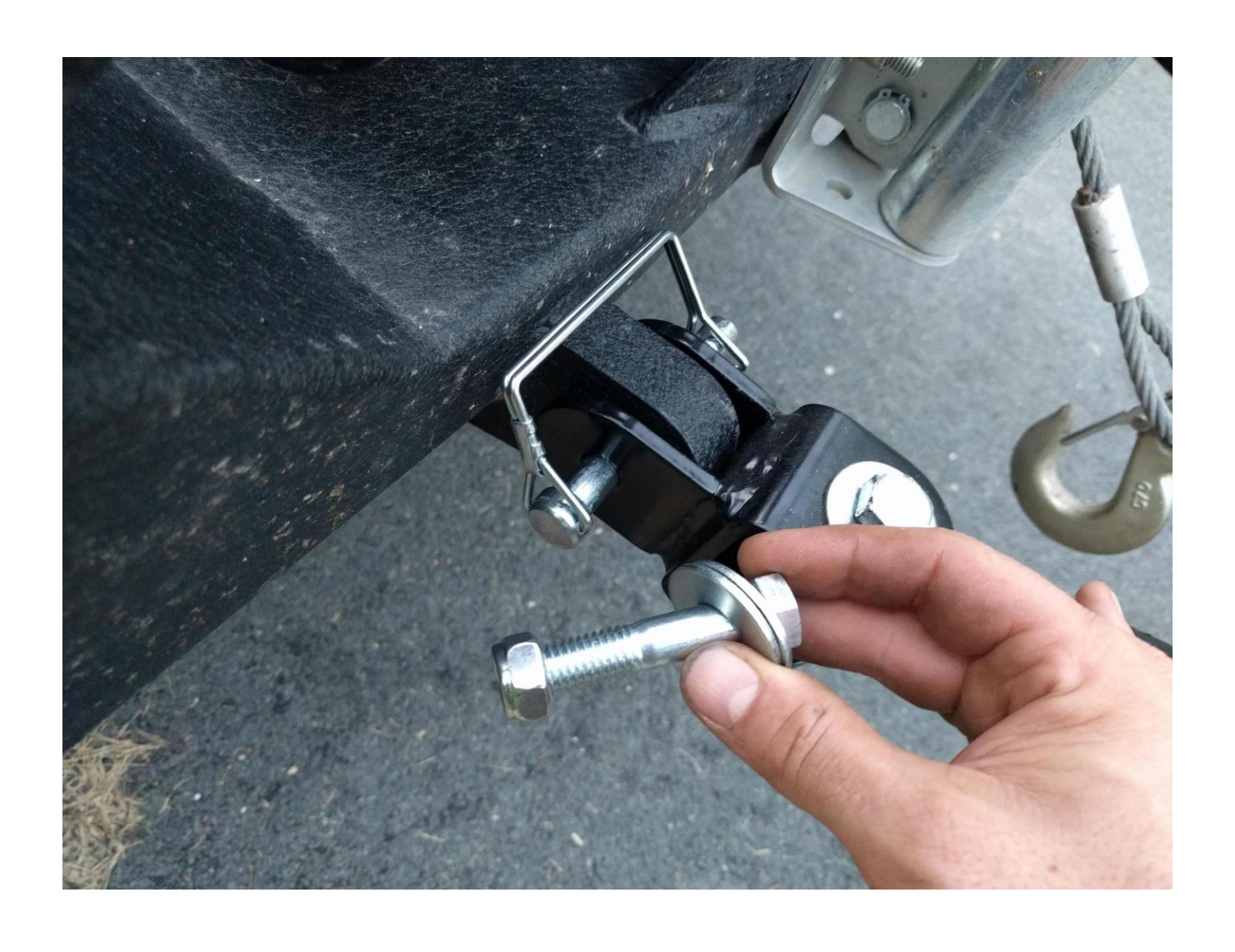
Installation Instructions Written by ExtremeTerrain Customer XXXXXX 08/20/2018