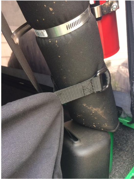
Rear Strap Installed