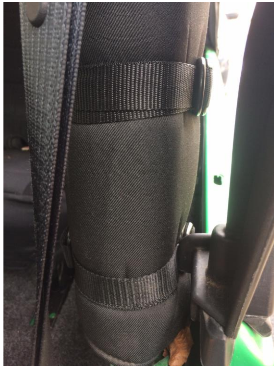
Seat Belt Operates Freely