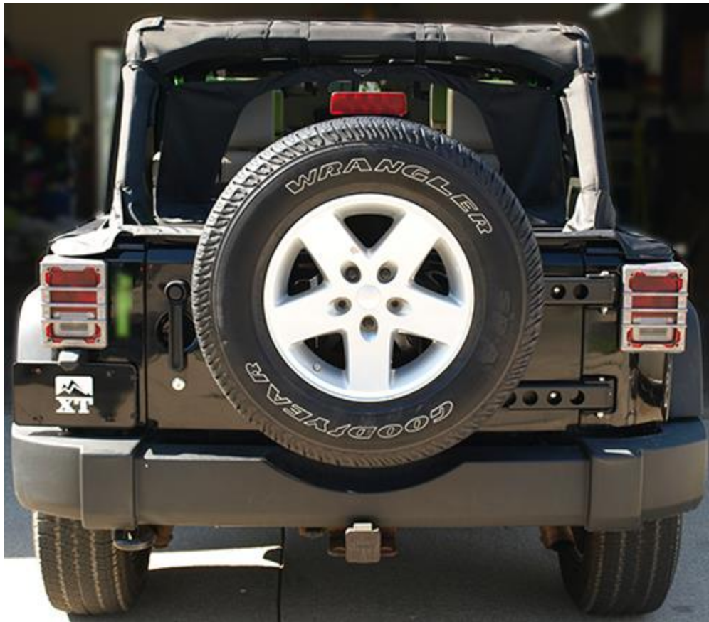
Installation Instructions Written by ExtremeTerrain Customer Brian Voelzke 07/19/2018