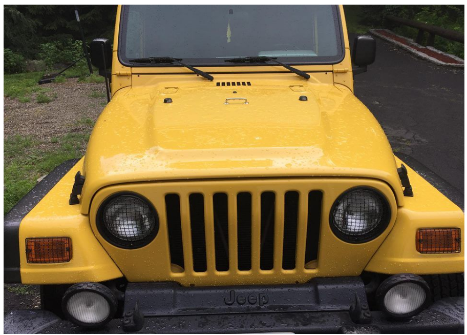
Installation Instructions Written by ExtremeTerrain Customer R. Manzo 06/28/2018