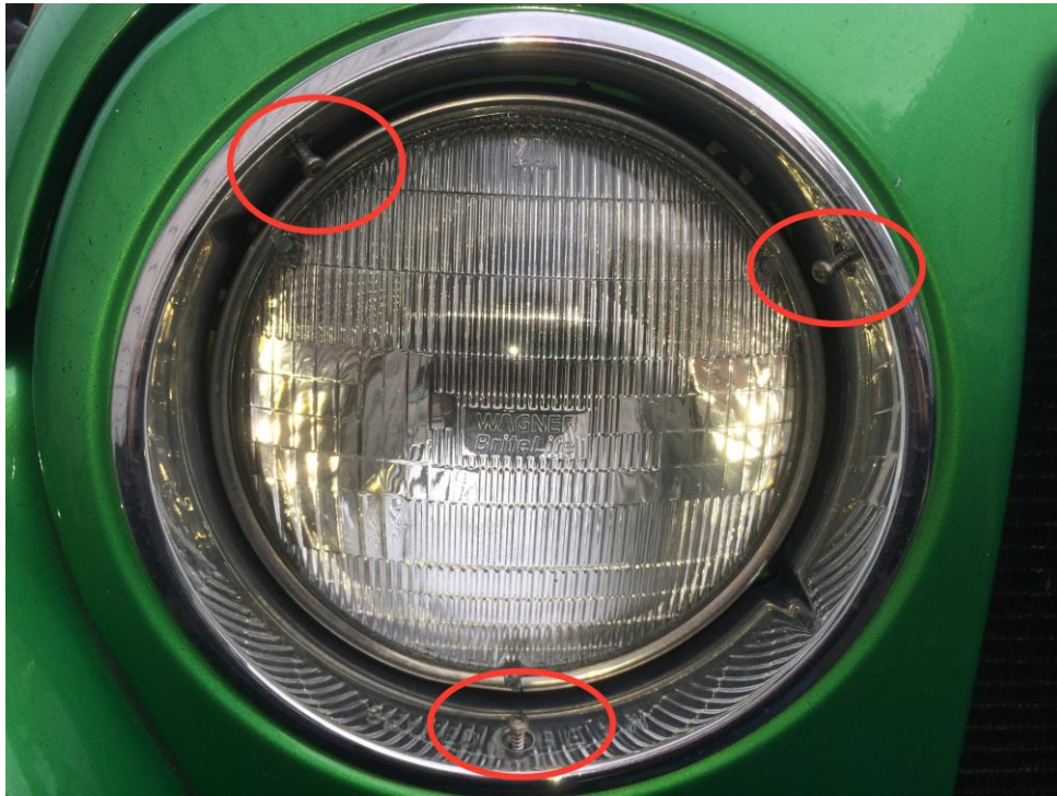
Location of 3 Bezel Screws