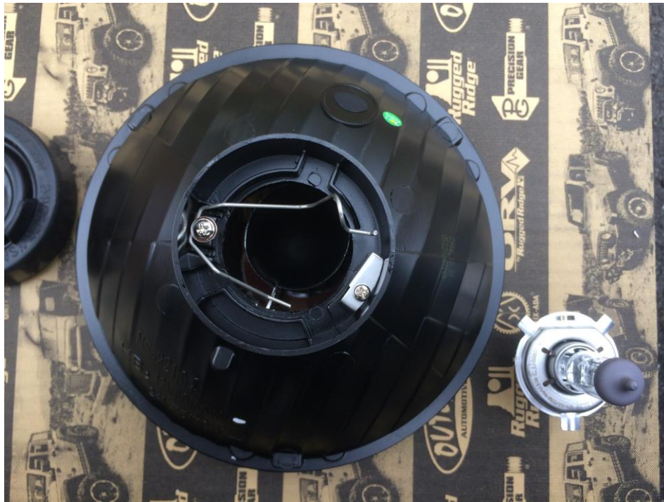
Back of Lens with Bulb Removed