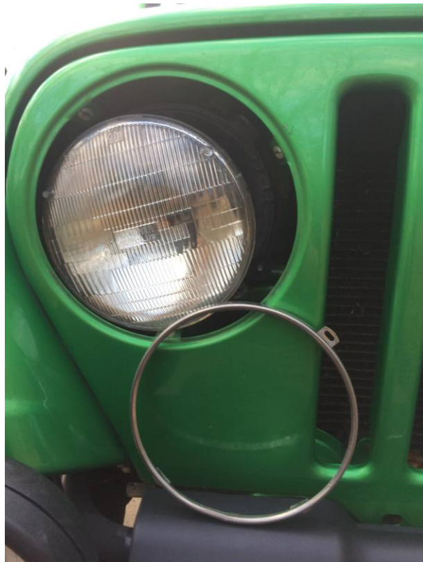
Retaining Ring Removed