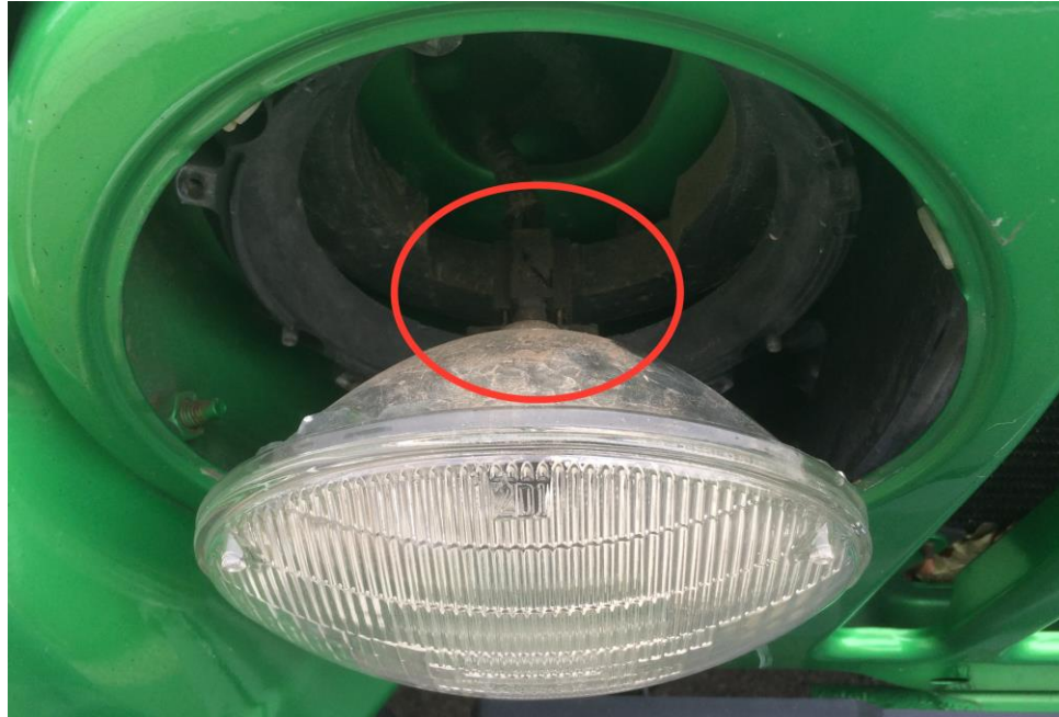
Location of Plug Circled

3. Pull the old bulb gently out and disconnect the plug from the back. Clean plug as needed.