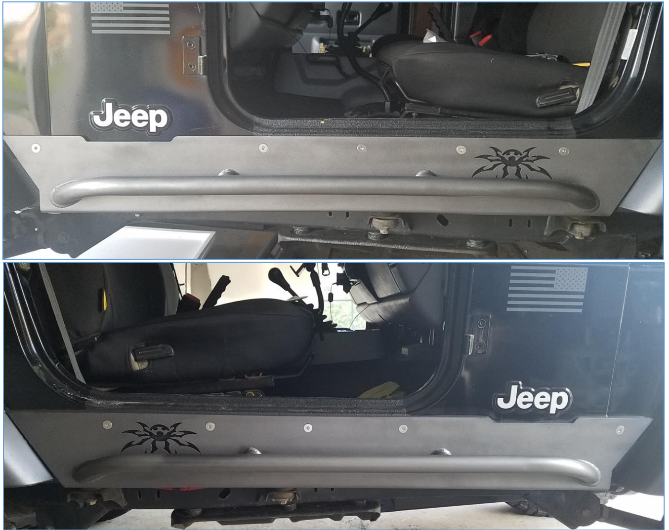
Installation Instructions Written by ExtremeTerrain Customer Tim Hoffecker 5/25/2018