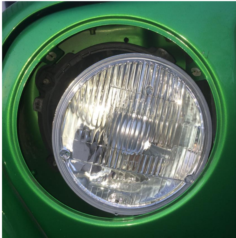
Retaining ring removed.