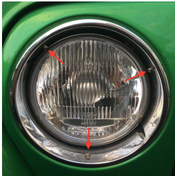
Location of 3 bezel screws.

3. With the bezel removed you will be able to locate the 4 retaining ring screws. You will also see the headlight adjustment screws. You will only be removing the 4 screws that go through the tabs on the retaining ring. Once the screws are removed the retaining ring will lift away and the headlight will drop slightly out of place. Retain the screws to reuse with the new ring.