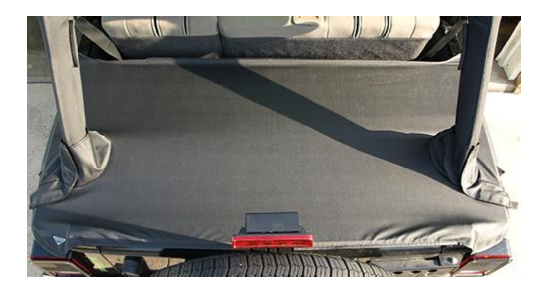
Installation Instructions Written by ExtremeTerrain Customer Brian Voelzke 06/27/2018