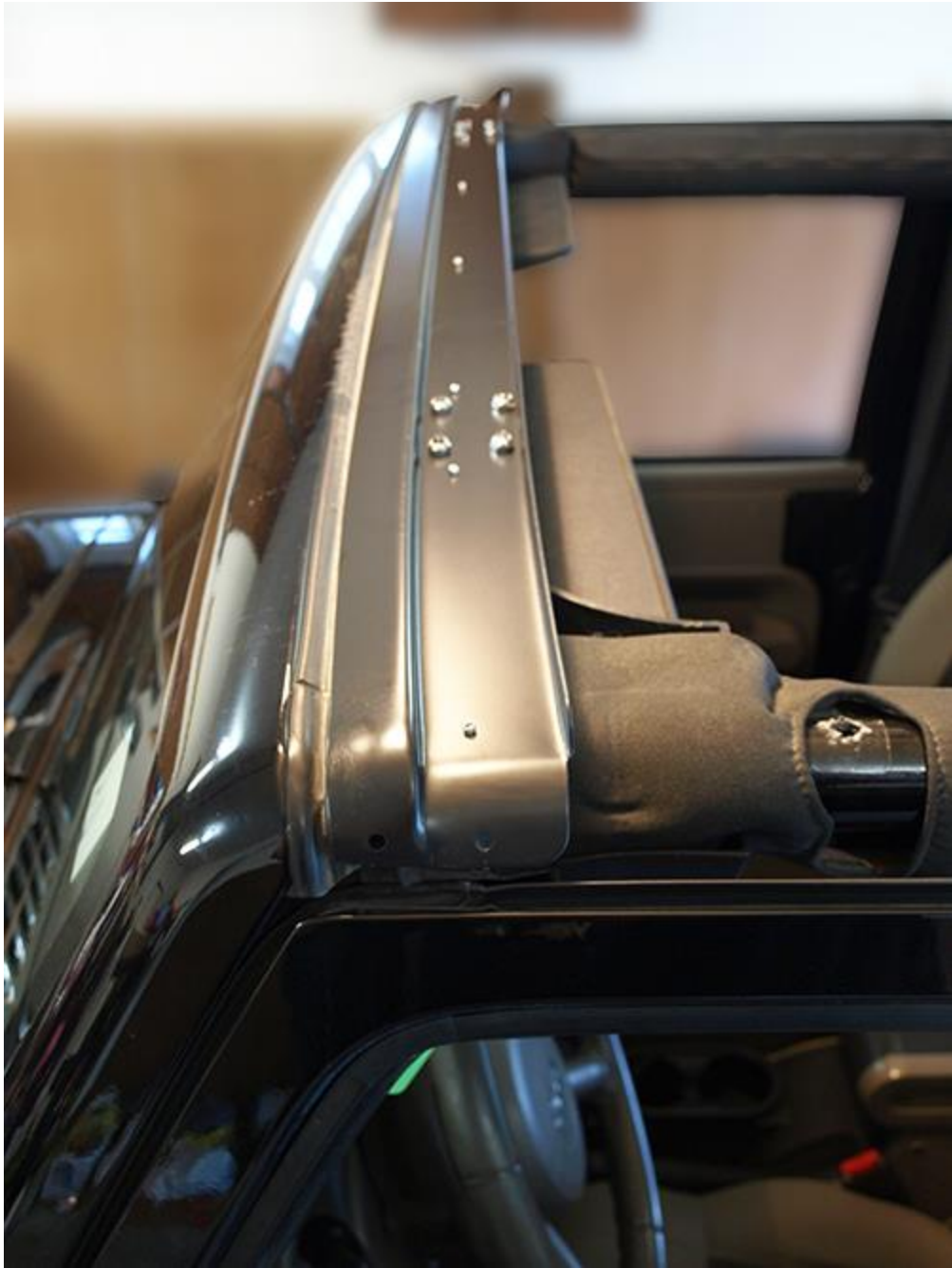
Installation Instructions Written by ExtremeTerrain Customer Brian Voelzke 06/15/2018