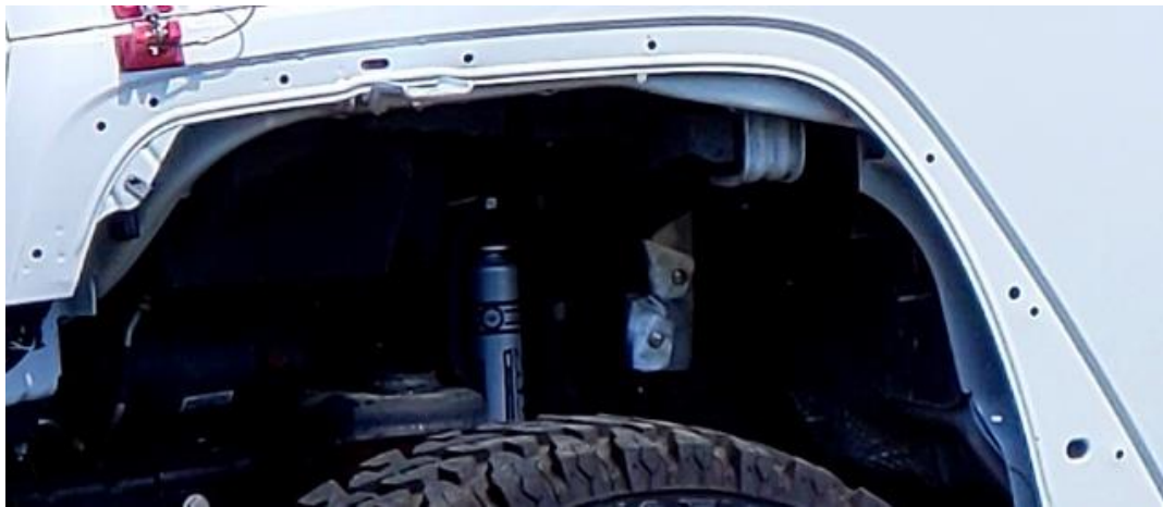
All plastic clips removed from outer body panel.