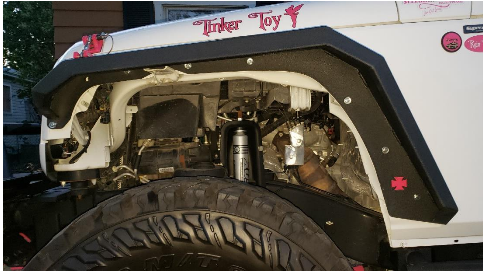
Fender flare installation complete w/o optional factory inner fender liner.