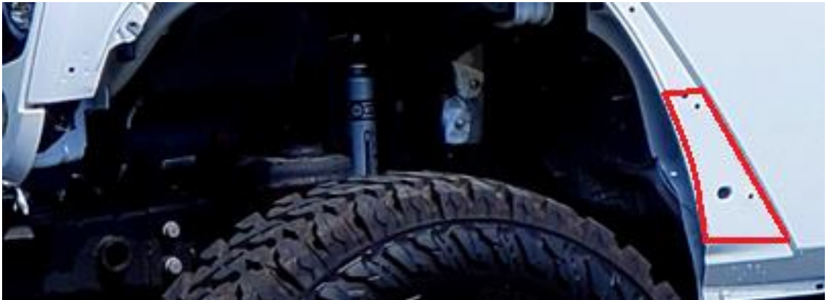
Factory inner fender liner trimmed. Location of optional access color outlined in red.

Option 2: Accent color for Iron Cross logo should be added at this time. Using vinyl or paint, add color to lower rear corner of fender opening. Do not go beyond body panel ledges.