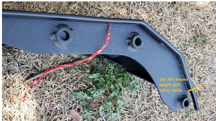
Installation of fender edge molding.