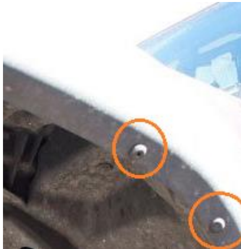
Just 2 of many button head clips on lower fender edge.