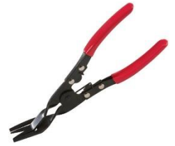
Auto Trim Clip Removal Tool