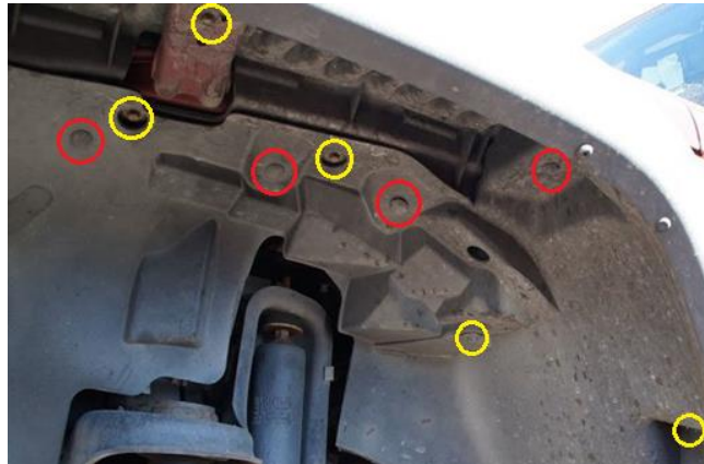
Locations of factory inner fender liner clips and bolts.