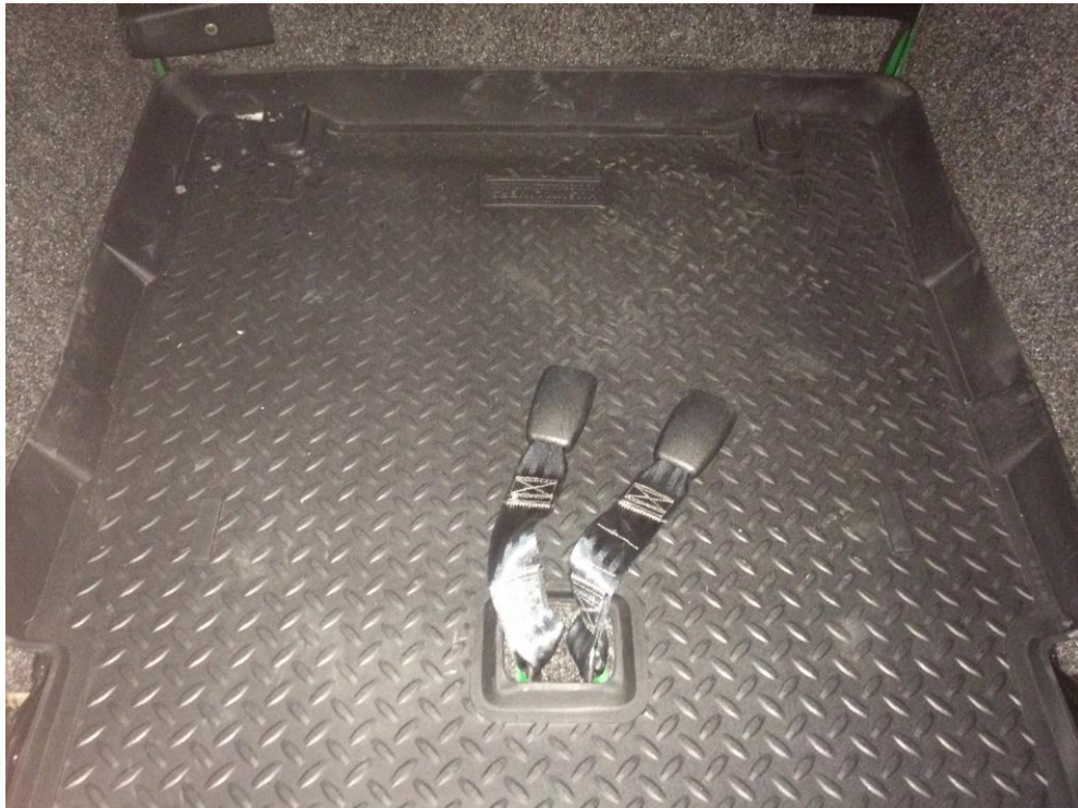
Installed liner viewed from front of Jeep looking back.