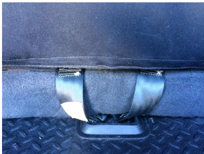
Rear seat in place with belts fed through seat.