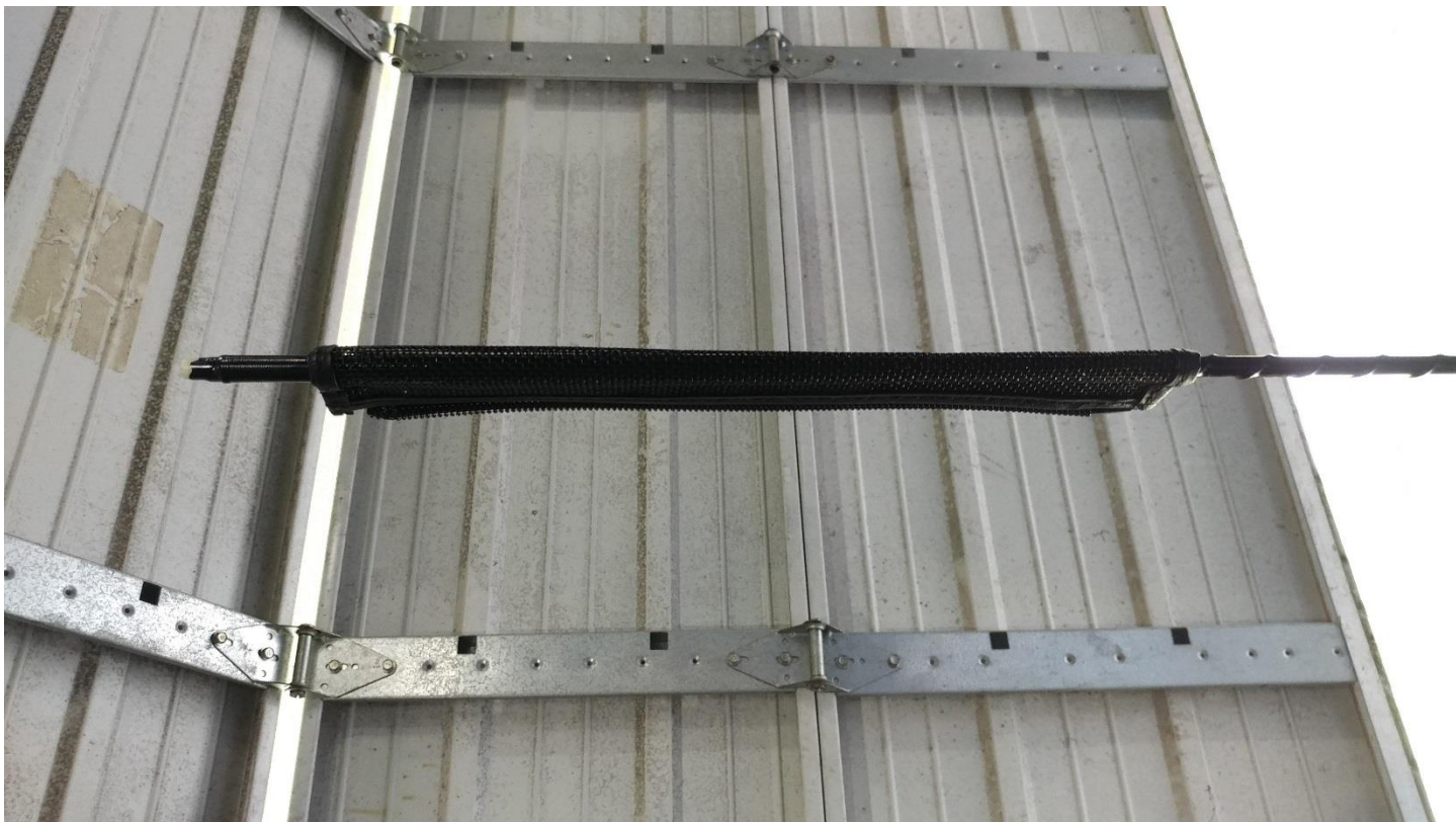
6. Reinstall the rubber tip