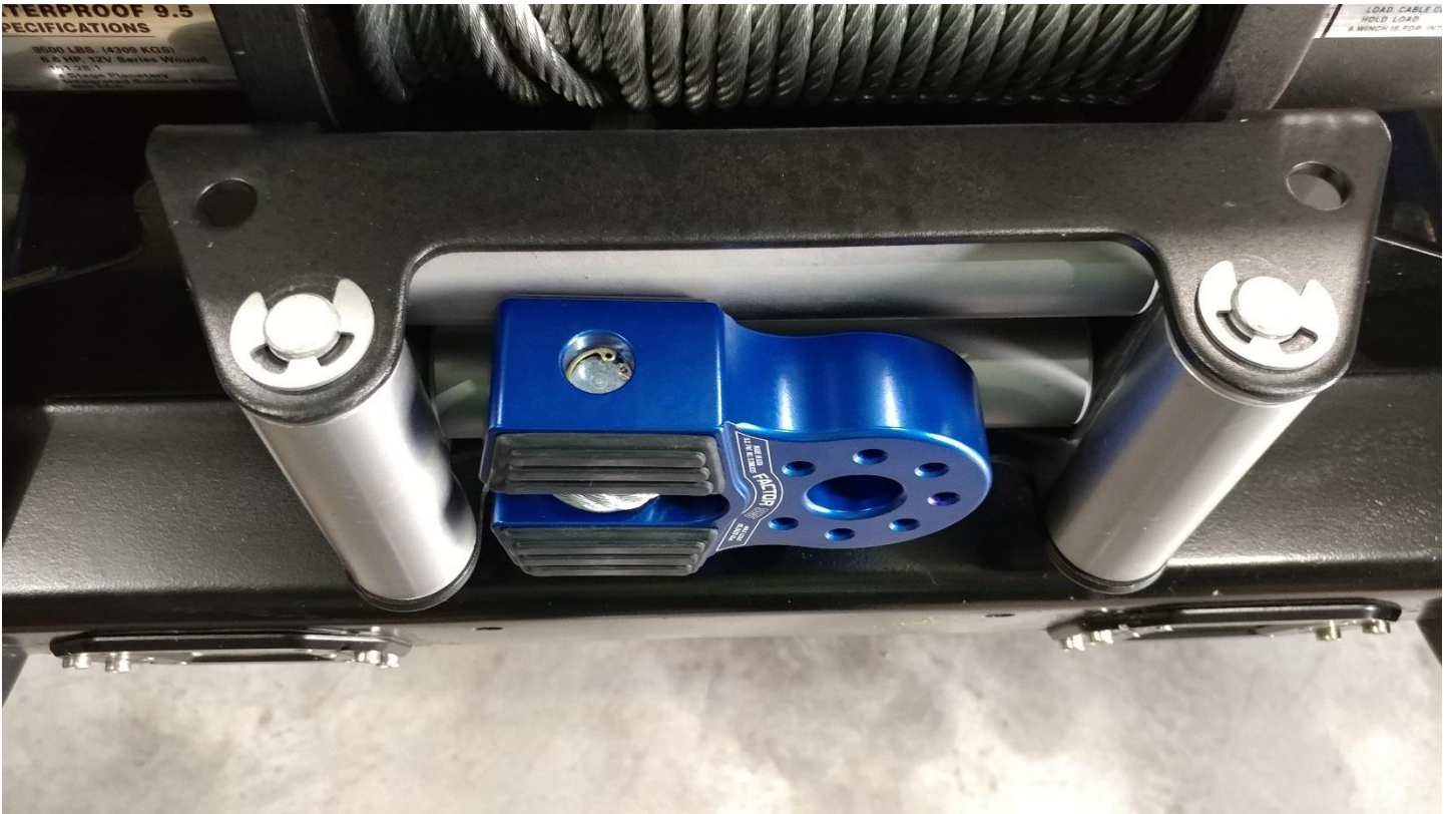
9. Installation complete