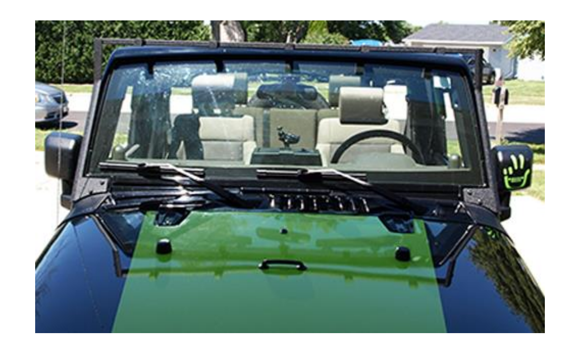
Installation Instructions Written by ExtremeTerrain Customer Brian Voelzke 07/08/2018