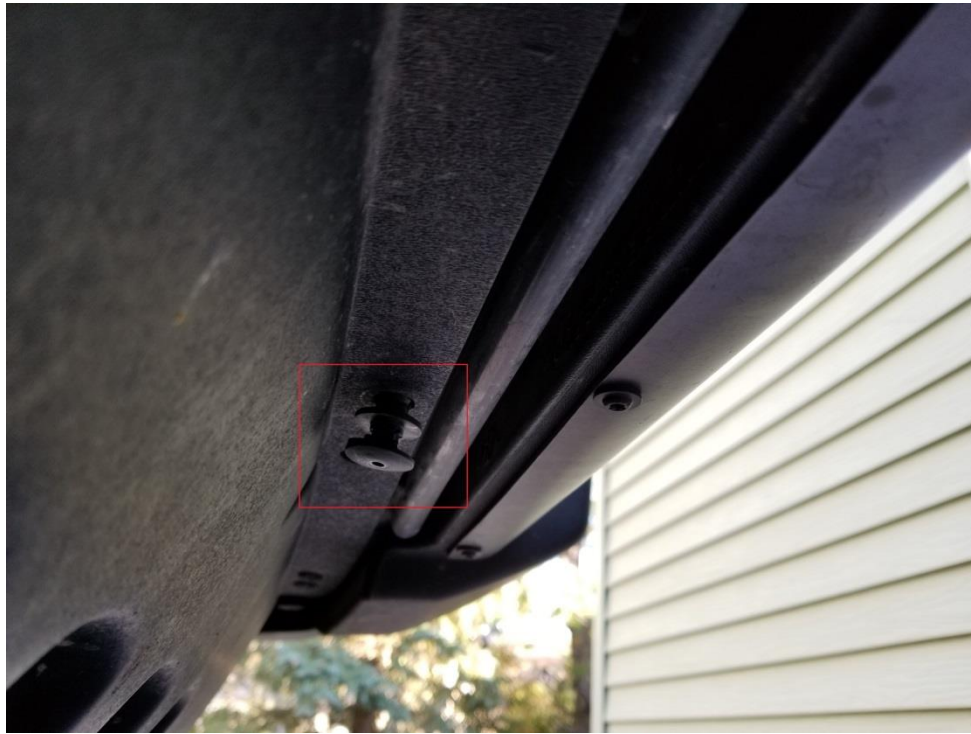
(Air dam retaining clip with center pin pulled out)