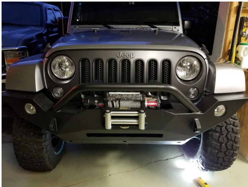
(After picture with optional winch installed)

Installation Instructions Written by ExtremeTerrain Customer on 08/10/2017