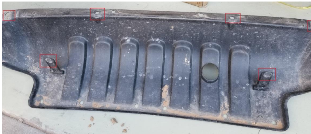
(Air dam retaining clip locations)