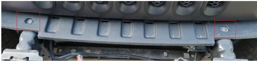
(retaining clip locations)