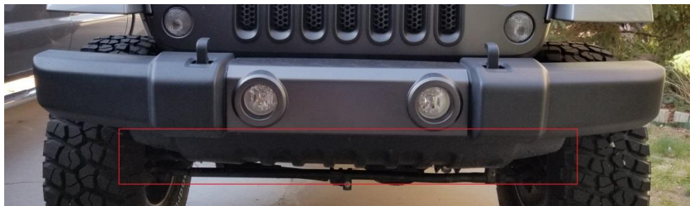
(Air dam location)