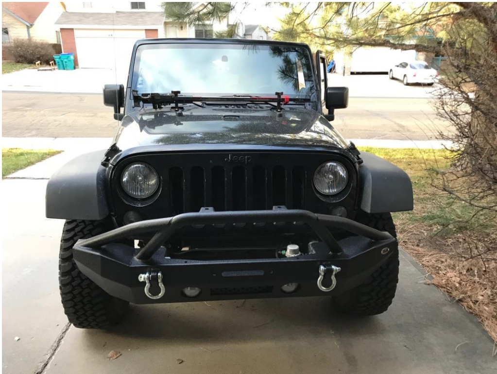
Installation Instructions Written by ExtremeTerrain Customer Jesse Heaton 12/01/2017