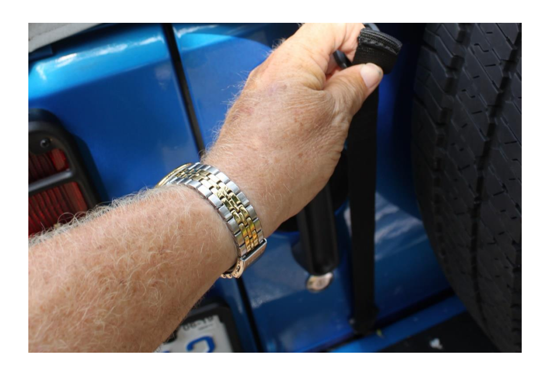
Tighten both rear straps.

12. Repeat this procedure on the other side. Once both sides are tucked into the tub rails hook the tailgate straps under the tail gate.