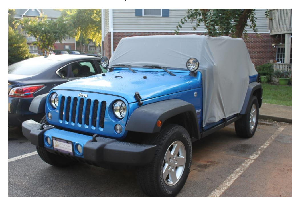
Installation Instructions Written by ExtremeTerrain Customer Jac Grimes 09/10/2018