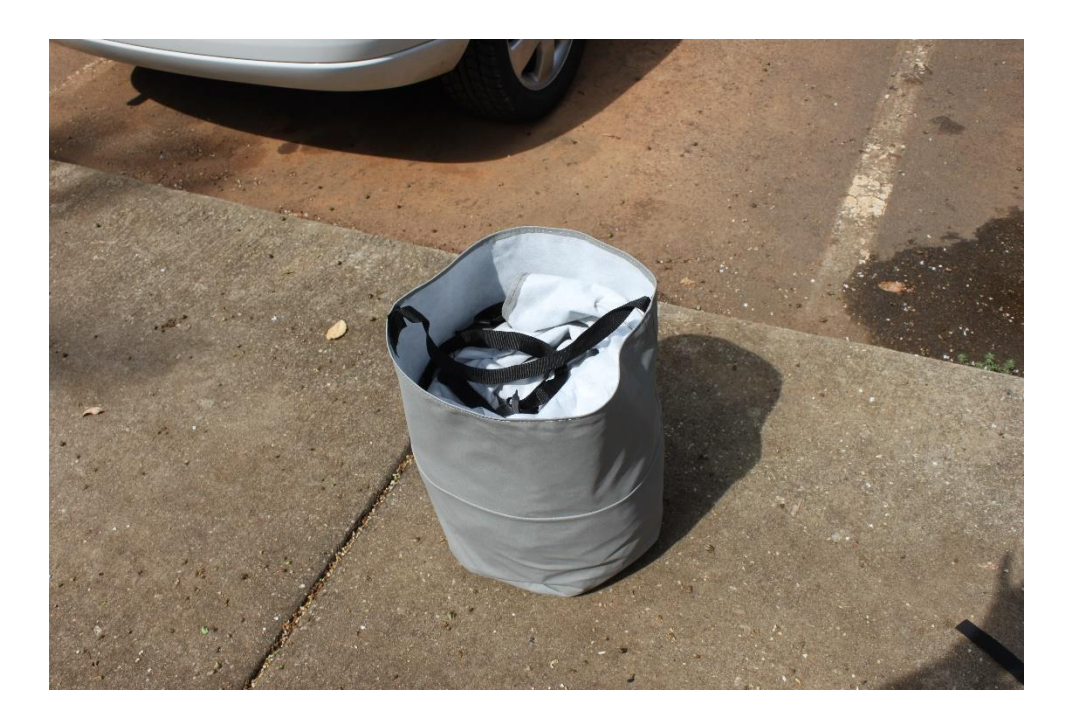
That's it. Enjoy the look and function of your RT Off-Road Waterproof Cab Cover. The bag is small enough to keep in the Jeep so you're ready for that sudden storm or shower anytime.