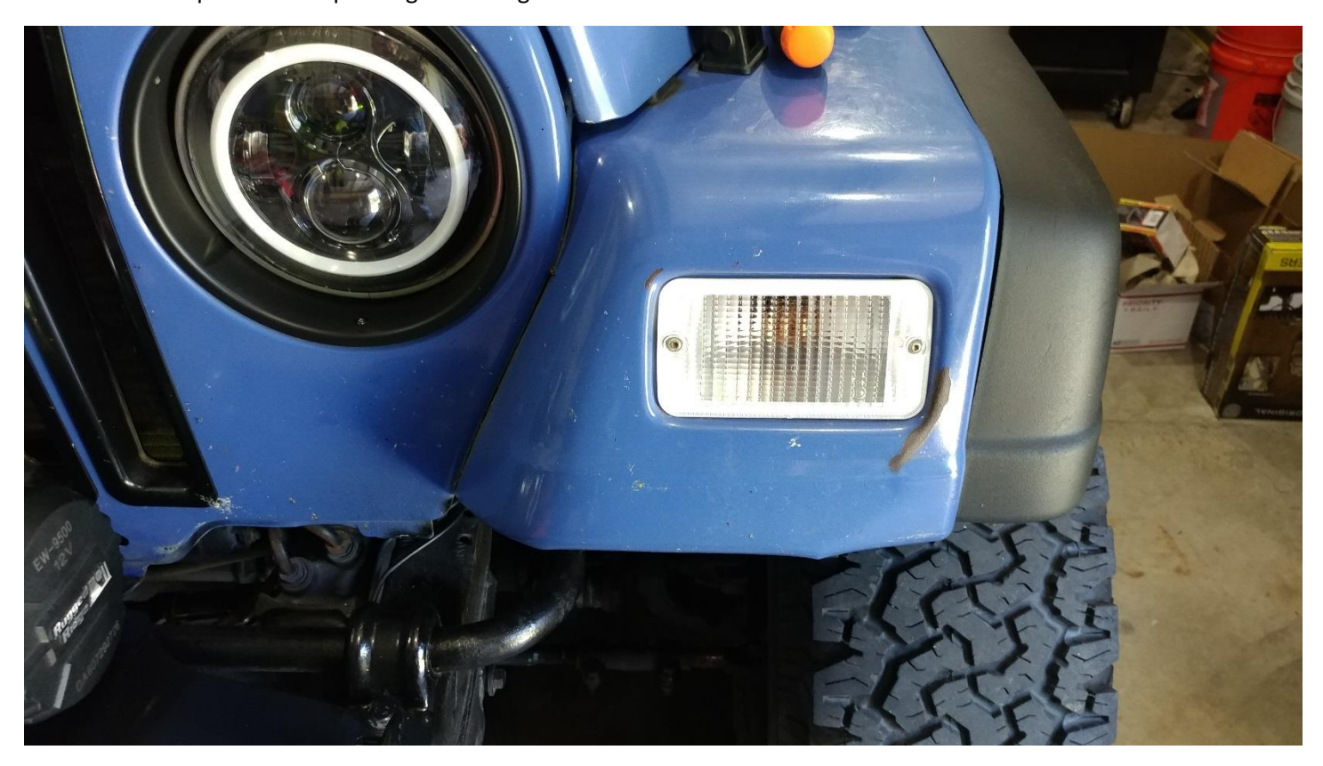
10. Installation complete

9. Use the pins to line up the light housing with the fender and install the 2 - T15 star bit screws