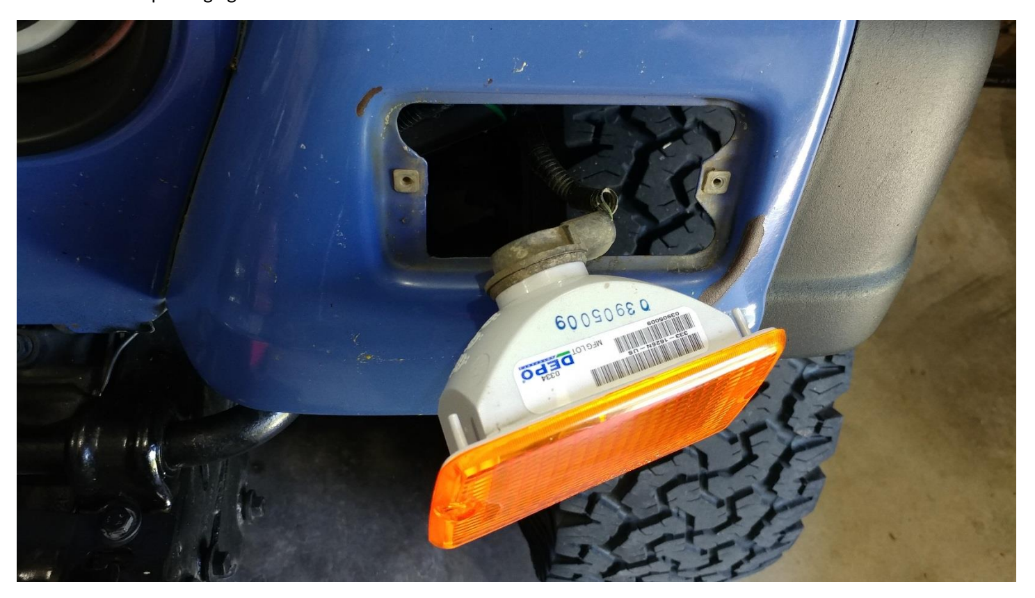
4. Twist the light socket clockwise and pull out