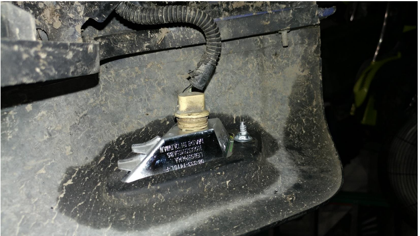
8. Installation complete