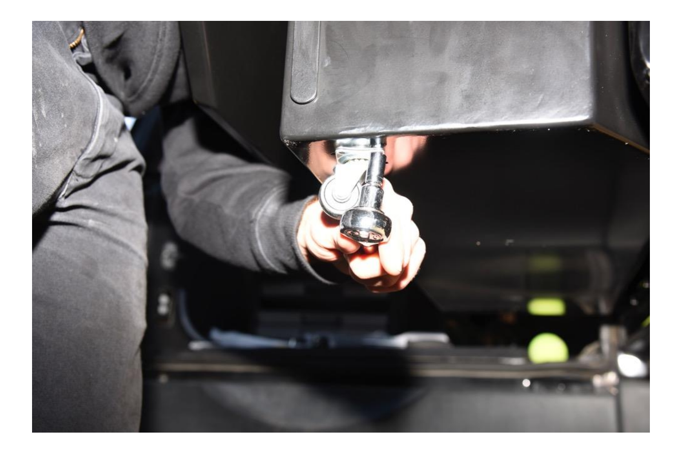
8.You have now completed Install of tailgate box