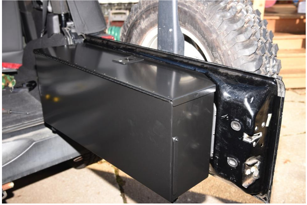
Installation Instructions Written by David Wasielewski 12/2/2018