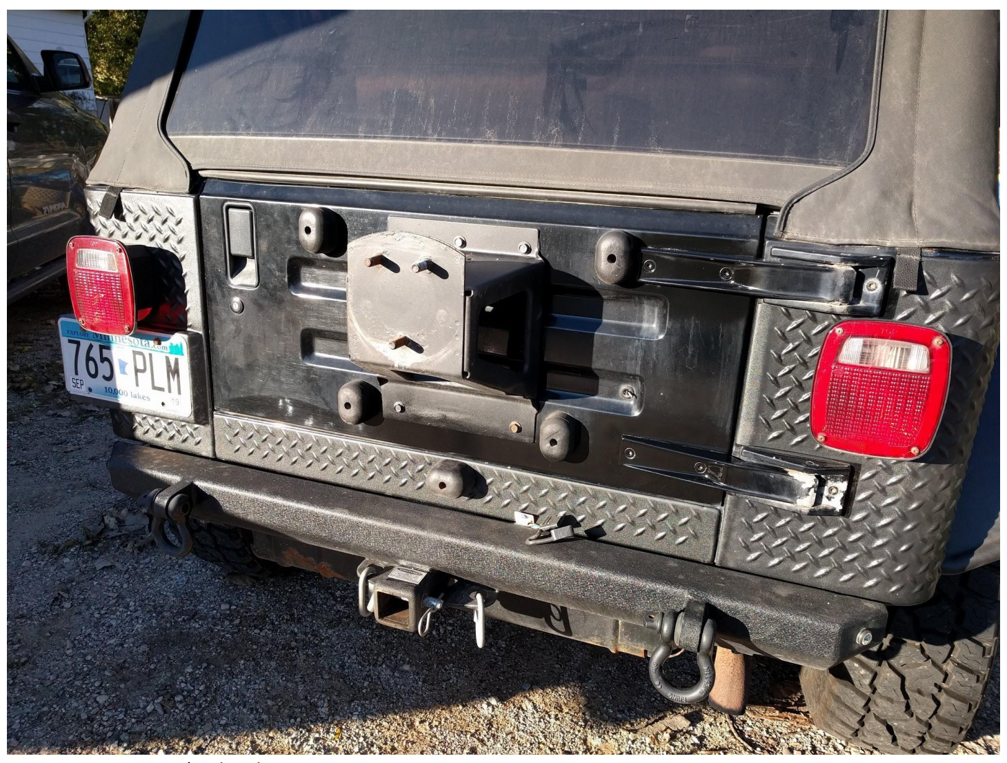
12. Congrats, you're done!