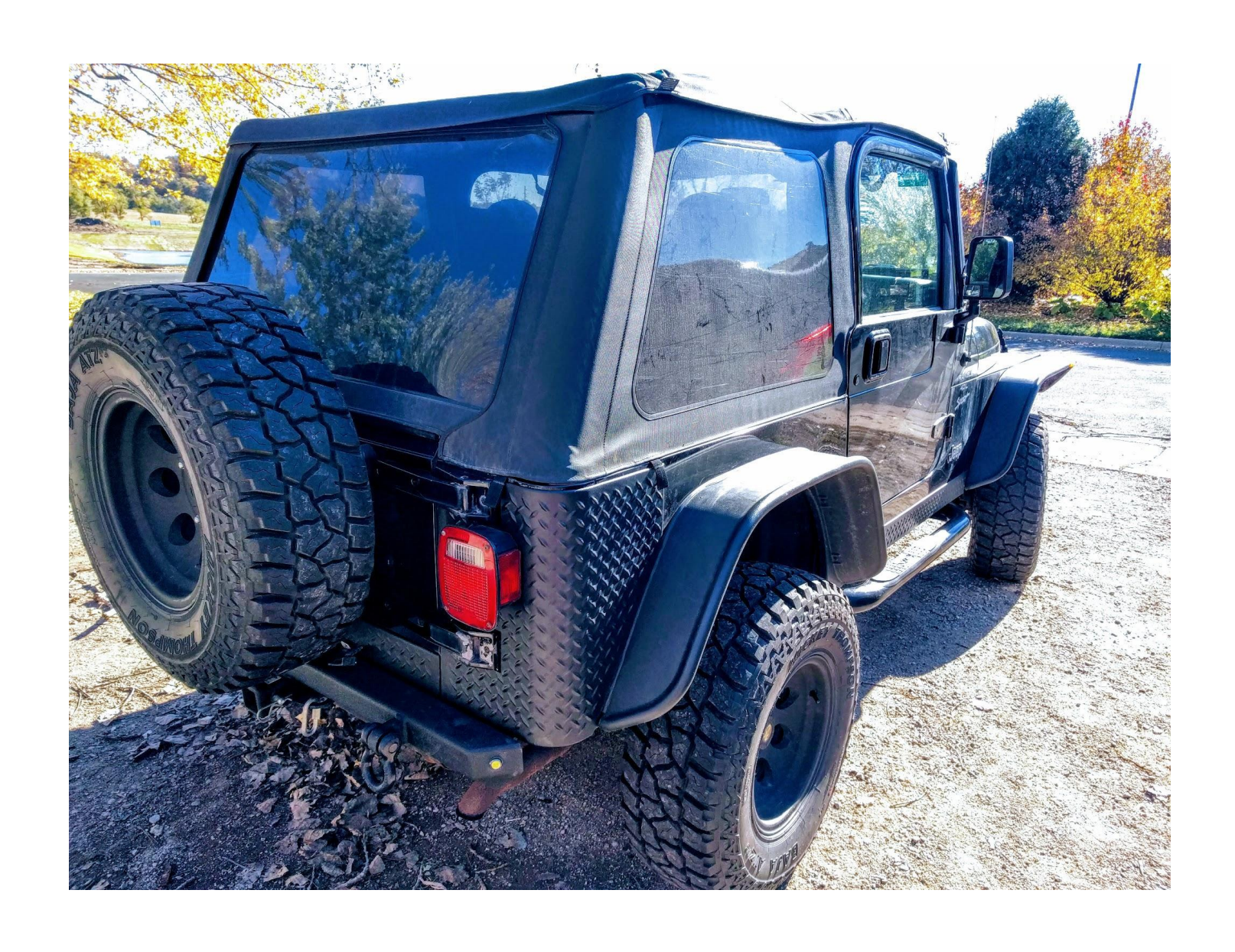
Installation Instructions Written by ExtremeTerrain Customer 10/18/2018