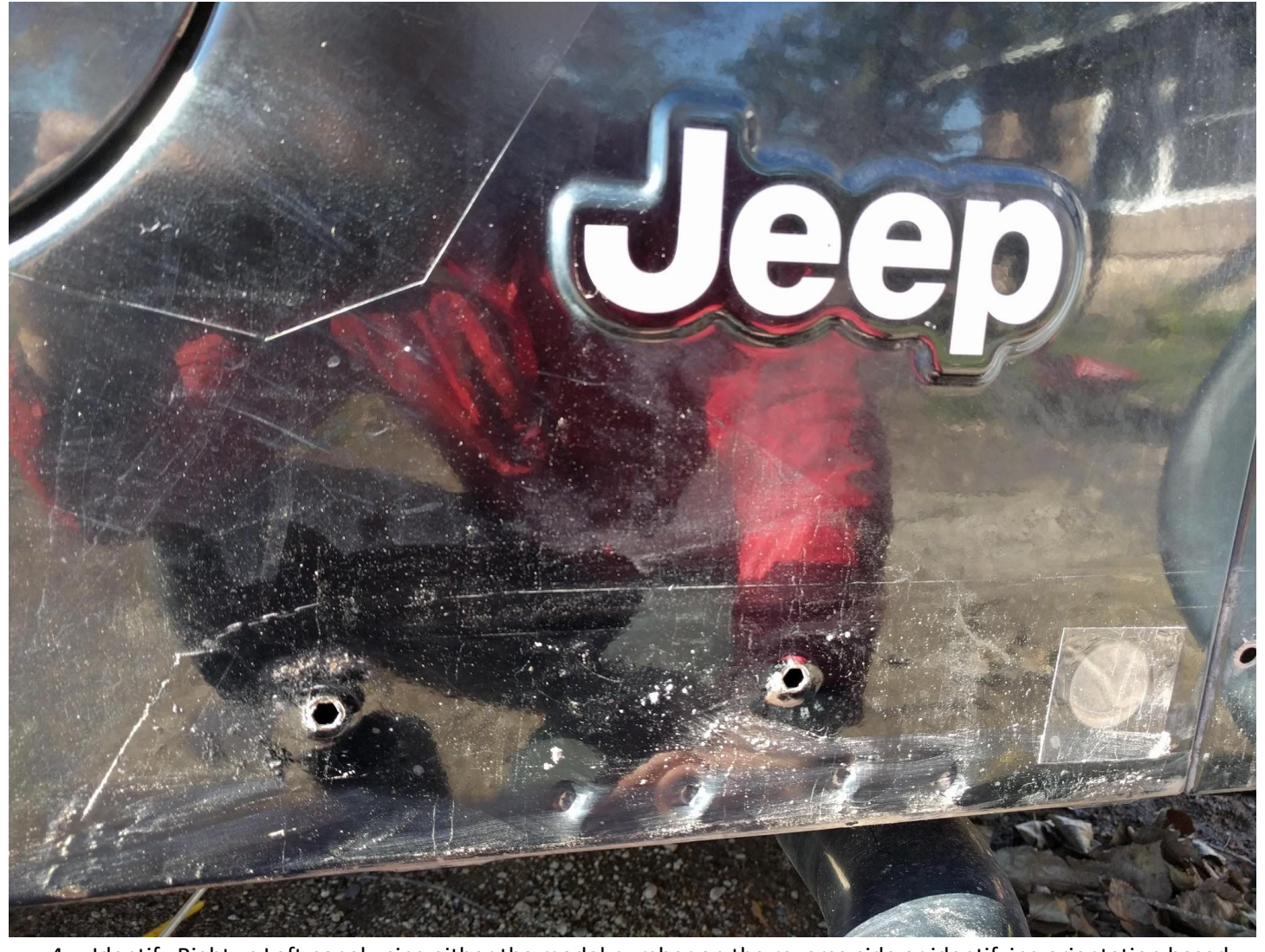
4. Identify Right vs Left panel using either the model number on the reverse side or identifying orientation based on location of fastener slots and using 3 plastic push fasteners lock first panel into place along bottom edge.