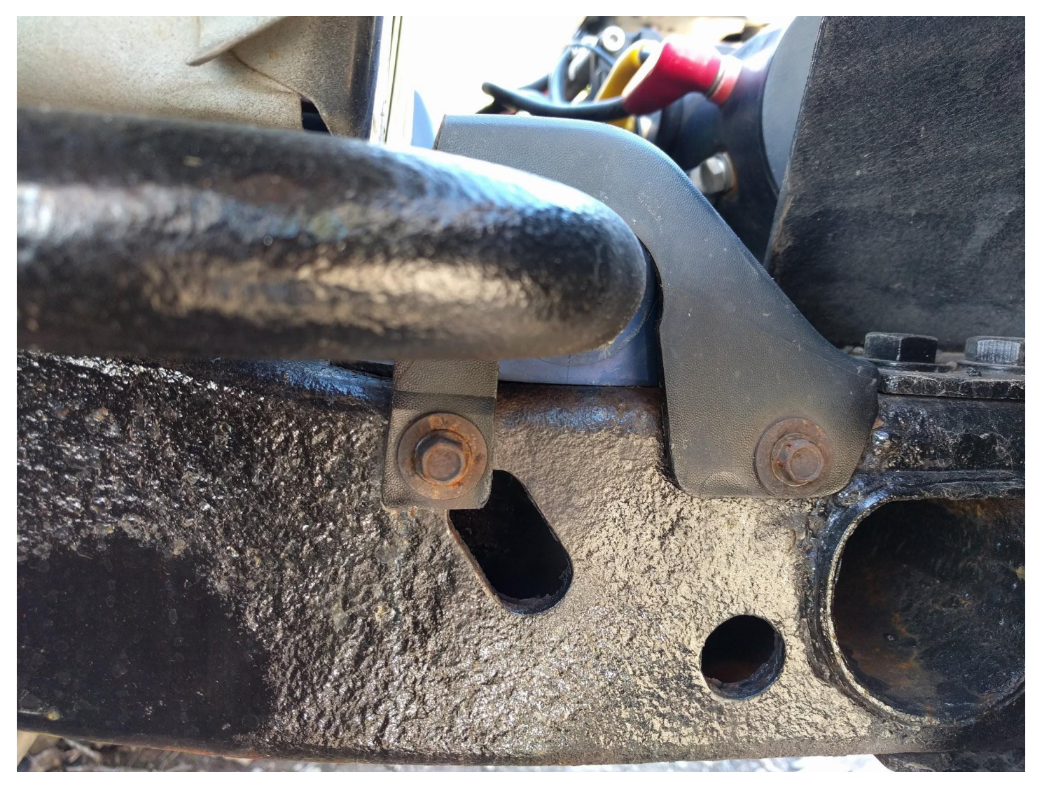
2. Install New Front Shroud using OEM 10mm Bolts. NOTE: Some trimming of front edge may be required with aftermarket bumpers/winches.