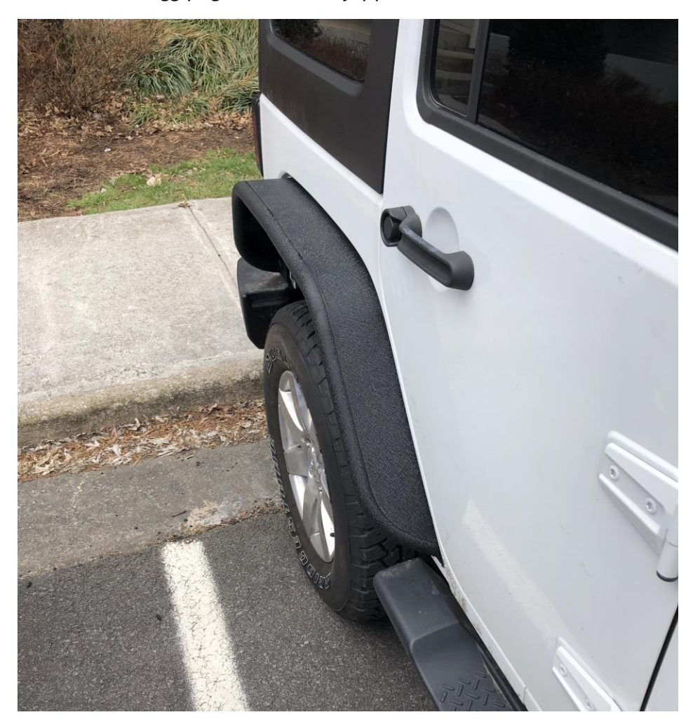
Installation Instructions Written by ExtremeTerrain Customer Ryan Burrow 04/02/2019

8. Double check all bolts are snuggly tightened and enjoy your new fenders!