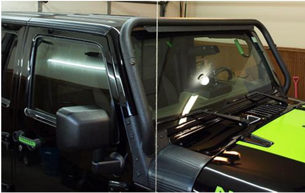
Installation Instructions Written by ExtremeTerrain Customer Brian Voelzke 01/06/2019