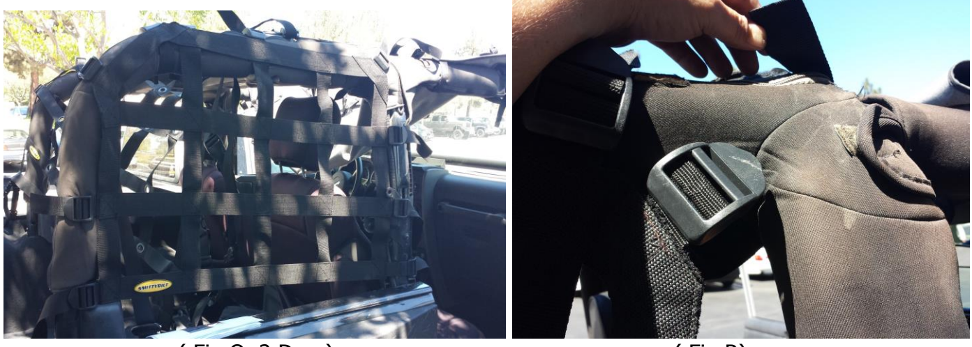
(Fig Q, 2 Door)