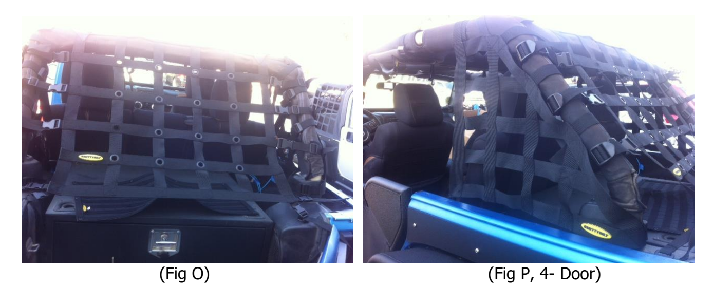
Step 7: Loosely place one side section on vehicle. Fig P, Q (Note the logo goes towards the rear of the vehicle).

<u>Step 6</u> : Once you have all of the straps on the center section loosely attached, go back and begin to pull all of them tight. (Fig O)